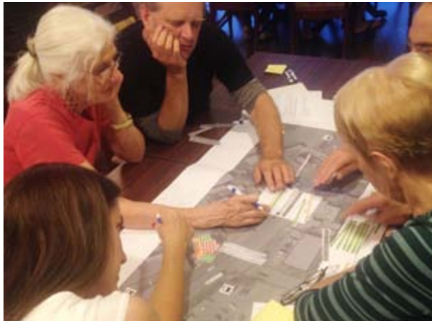
June 2015 Design Charrette

The Beechwood Avenue Complete Street Functional Design Study is one of the first times in Ottawa where a functional design was completed prior to specific plans to rebuild in the near future. The study intended to address two key themes: How can the city leverage the upcoming wave of re-development? How could the plan be designed for implementation on a lot by lot basis?