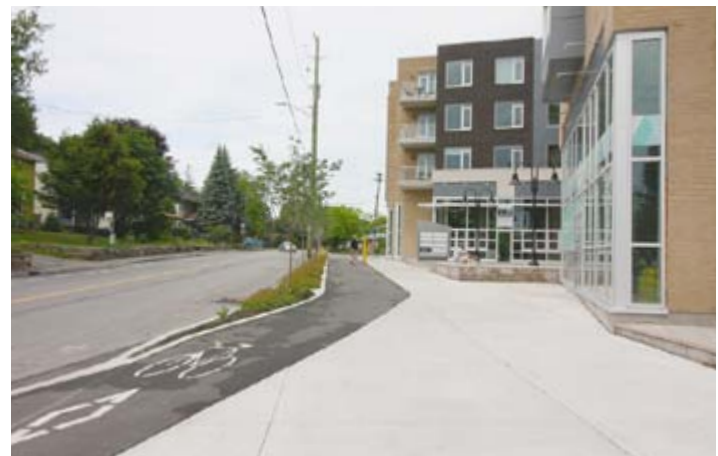
22 Beechwood Avenue before and after redevelopment 2